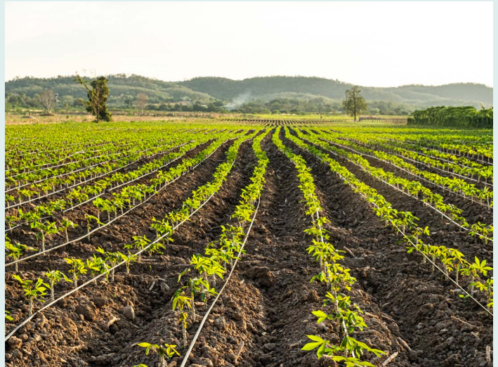
Sustainable irrigation in agriculture