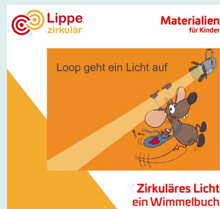
Picture book on the topic of "circular value creation"