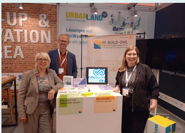
Exhibition booth of the initiative RE-BUILD OWL

Educators and multipliers in day-care centres, open all-day schools and primary schools are sensitised to circular action through specially developed circular training programme.