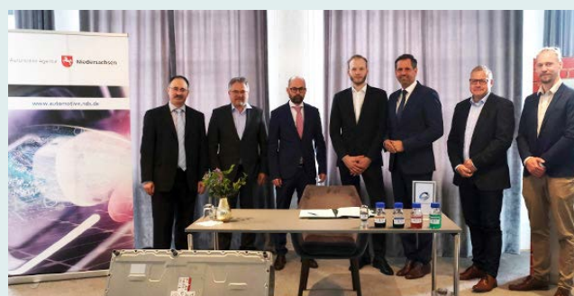
Signatories of a Memorandum of Understanding on the Establishment of a Battery Recycling Centre

By addressing the topics of digitalization and the integration of renewable energies, the initiative tackles two key issues of the future. REWIMET thus contributes to the ability of its members to continue to present innovative approaches. As a result, REWIMET will keep promoting the competitiveness of the Recycling Region Harz. If REWIMET further engages with the public through its projects, it will actively contribute to strengthening systemic circular economy principles within society.