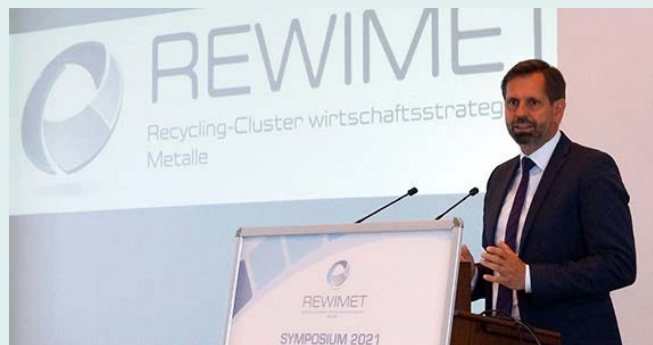
Lower Saxony's Environment Minister Olaf Lies at the REWIMET Symposium 2021

not occur as frequently in their everyday work environments. Consequently, the events organized by REWIMET contribute to an increase in knowledge and the circulation of information among the participants.